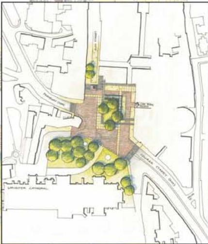
Cathedral Square - Concept Plan