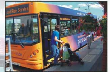
New Park & Ride Facilities