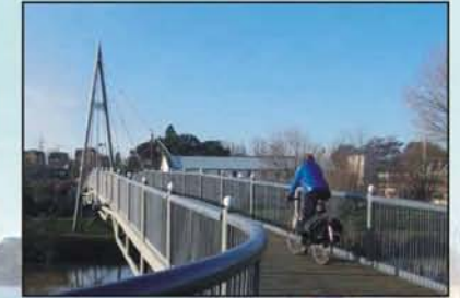
Cycle Route Enhancements